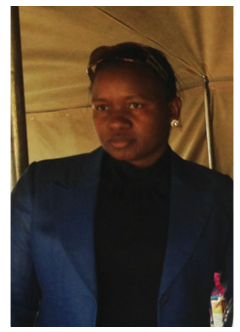
Lorwana Primary School 2013 top achievers

or a school, especially in a rural setting area of Digawana, to move from 29 percent to 90 percent pass rate is not a small achievement by all standards. But, this is what Lorwana Primary School in Good Hope Sub district has done, attaining 90 percent pass rate in the 2013 Primary School Leaving Examinations (PSLE) from 29 percent pass rate in 2012 and thus becoming the toast of the whole Southern region. It was then fitting for the school, in joint effort with the regional education office, to organize the class of 2013 standard seven student's victory party to celebrate the achievement to which Botswana Examinations Council contributed a printer and some promotional items.